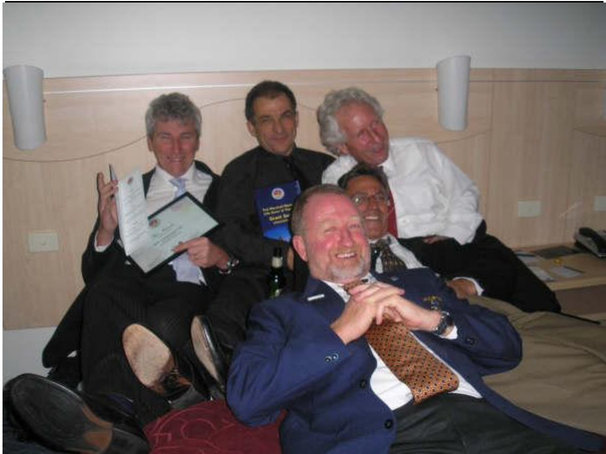
Some happy Coalcliff members after the Illawarra Awards of Excellence