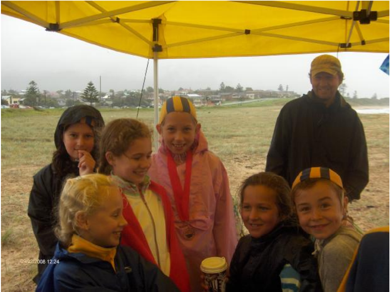
Wet cold but still smiling. Some of the Coalcliff competitors at Illawarra Branch Championships